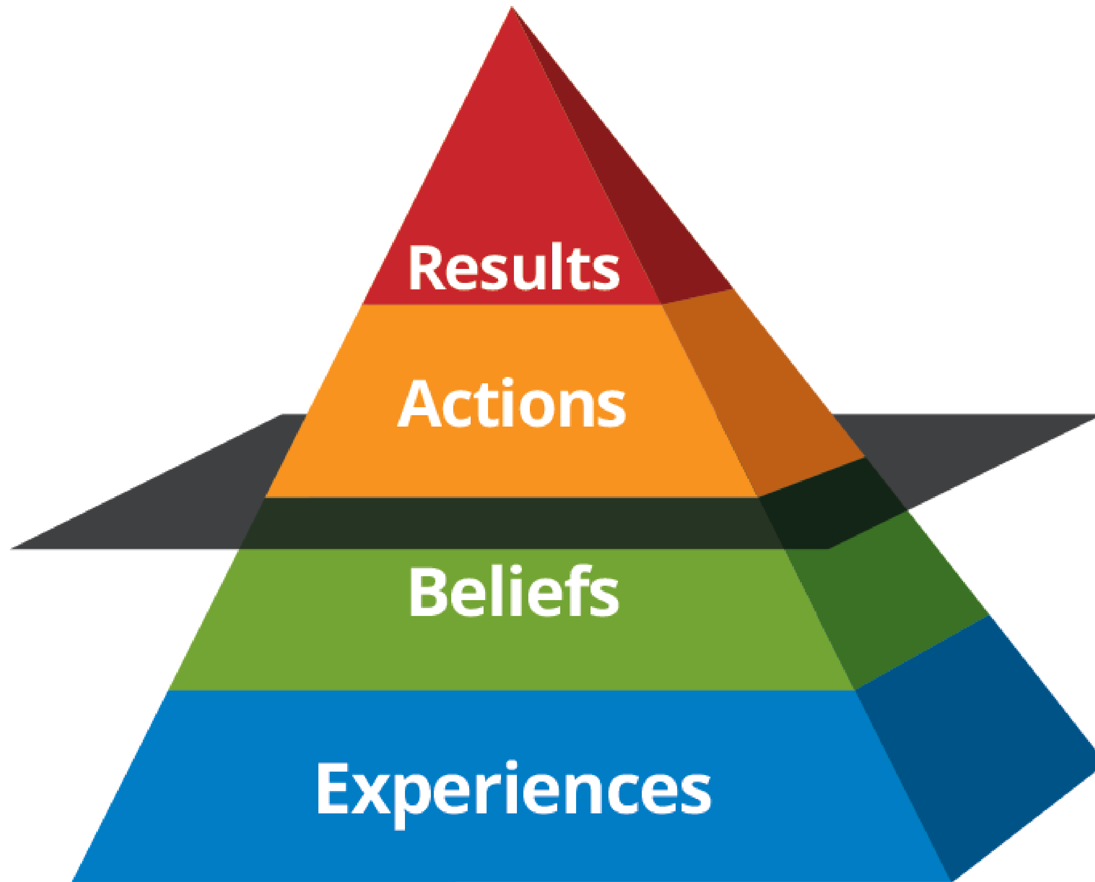
The Results Pyramid®